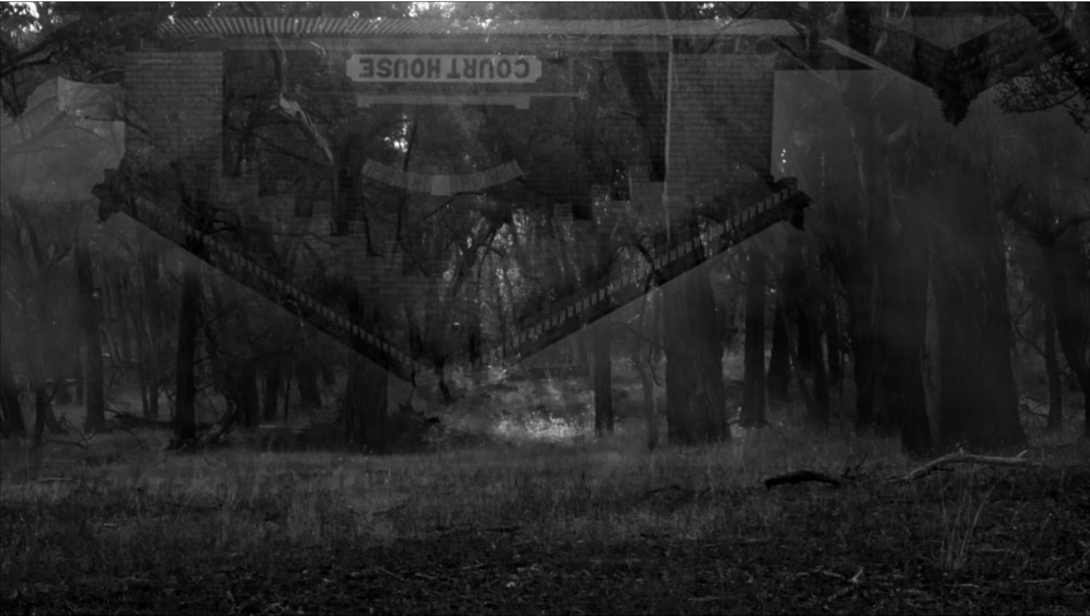
Subverted light, legal palimpsest #1 Angus Vance | September 2021 Cyanotype*

*Note, these are digital mock-ups for the Miegunyah Student Project Award Exhibition 2021 . Due to the coronavirus commerce and travel restrictions, I have not yet been able to access to darkrooms and other facilities.