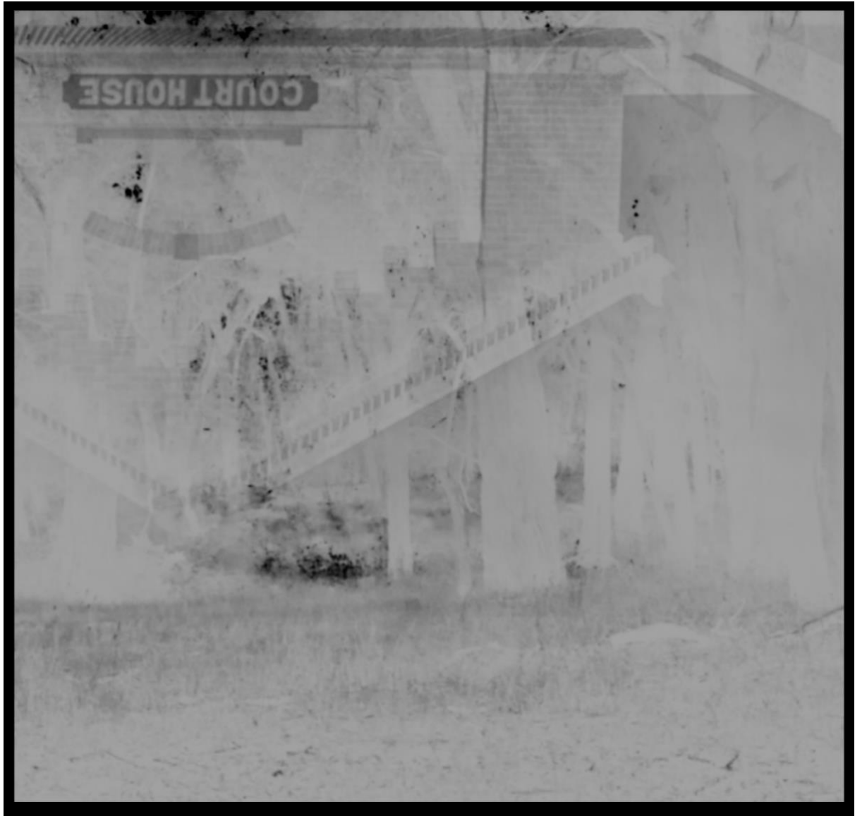
Inverted light, legal palimpsest #2 Angus Vance | September 2021 Printed Negative*