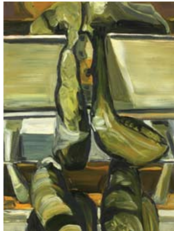
Cat. no. 67 Moya McKenna Untitled 2005